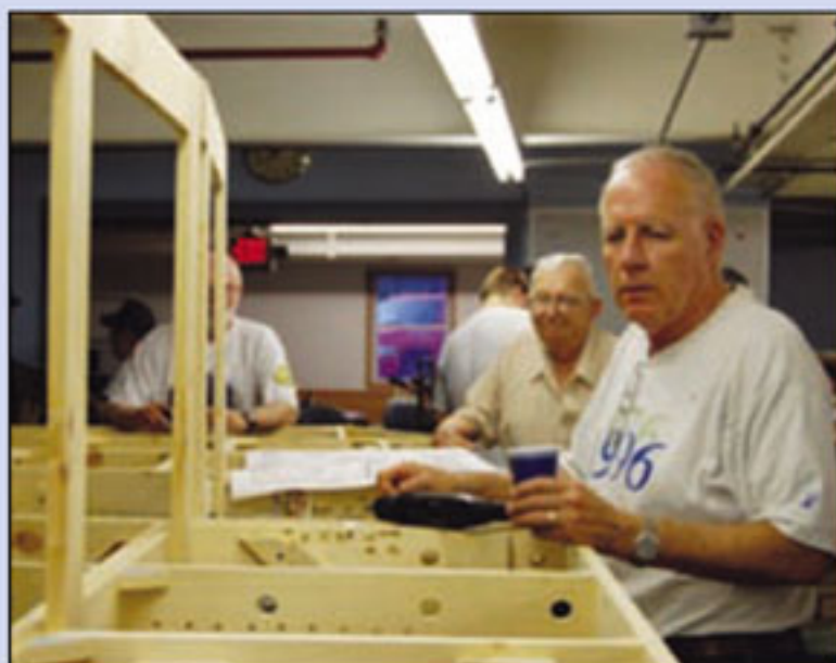
Members of the Worcester Model Railroad Club work together on building a structure for a track at their new home in Dudley.